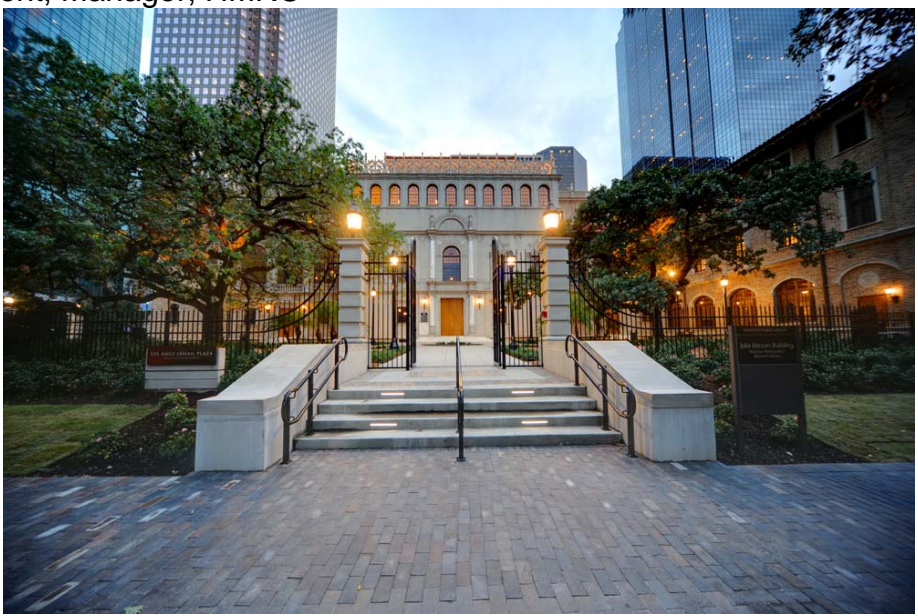
McKinney Entrance to the Julia Ideson Building